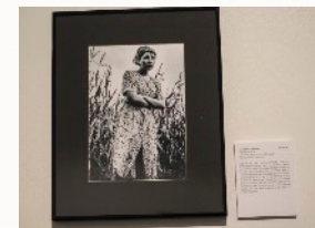
PIECE TRAVELING AS PART OF GTS

THE K12 MICHIGAN DEPARTMENT OF EDUCATION SHOW IS ALSO SELECTED FROM THE TOP 100 2D WORKS. THIS WORK WILL BE ON DISPLAY FOR 1 YEAR AT THE DEPARTMENT OF EDUCATION.