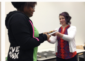
STUDENT RECEIVING TOP 18 AWARD AT LUNCHEON