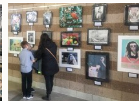
HIGH SCHOOL WORK DISPLAYED AT REGIONAL SHOW.