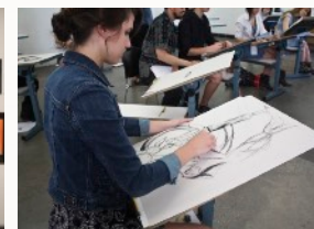
WORKSHOP AT MYAF